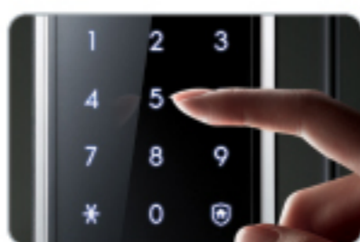
Press the user access code