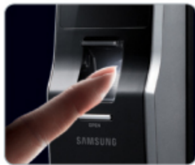
Biometric Access System