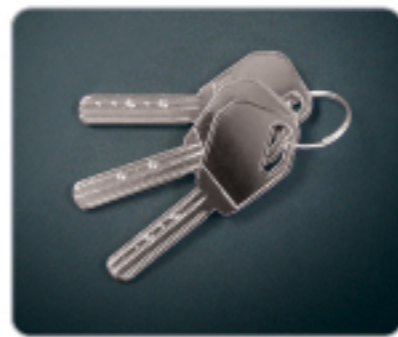
Mechanical Override Keys