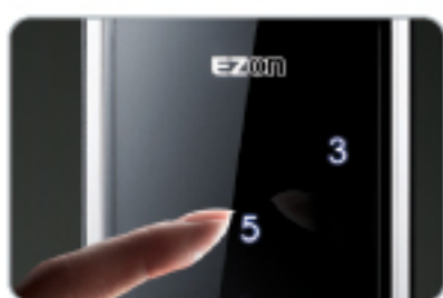
2 random numbers appear before entering user access code