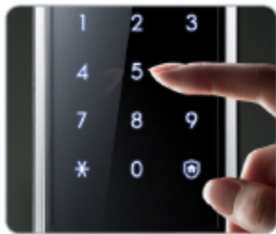
User Access Code