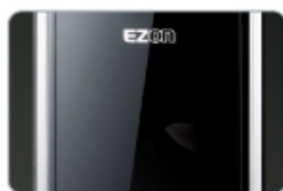
Impossible to guess user access code due to random fingerprint marks